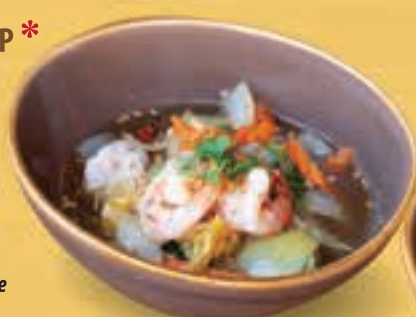
WANTON & FRESH EGG NOODLE SOUP

Minced chicken with chilli, garlic and basil blended sauce with fried egg.