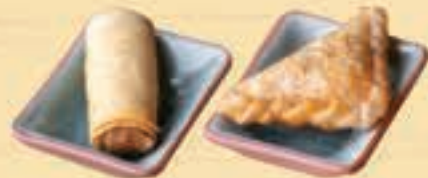
SPRING ROLL / CURRY PUFF