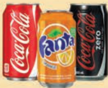
Coke / Coke No Sugar / Diet Coke / Lemonade / Lemon Squash / Fanta

SELECT A CAN OF SOFT DRINK OR A BOTTLE OF SPRING WATER