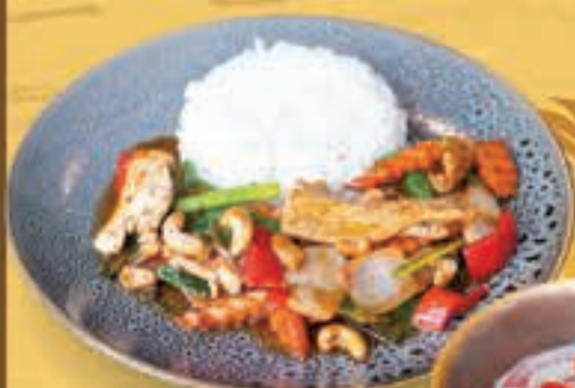
CASHEW NUT STIR-FRIED