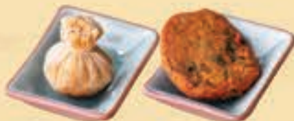
MONEY BAG / FISH CAKE