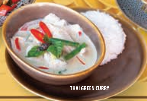
THAI GREEN CURRY