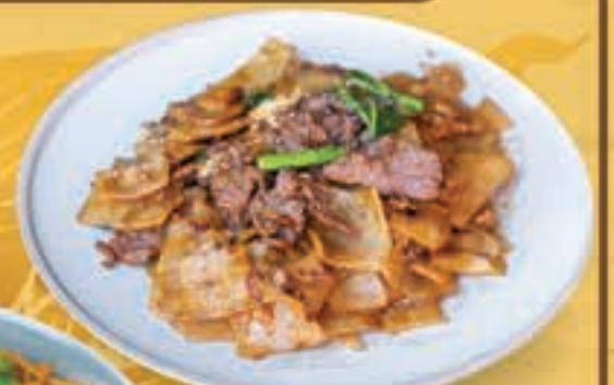
PAD SEE EIW