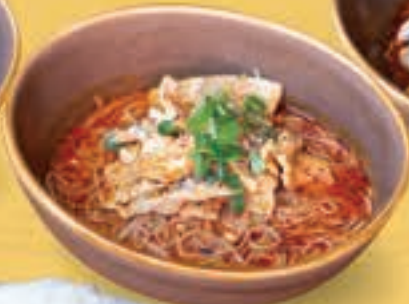
LAKSA NOODLE SOUP