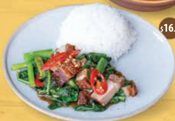
KANA MOO GROB