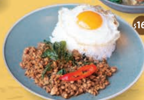
CHILLI BASIL CHICKEN-MINCED WITH FRIED EGG