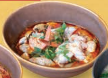
TOM YUM NOODLE SOUP