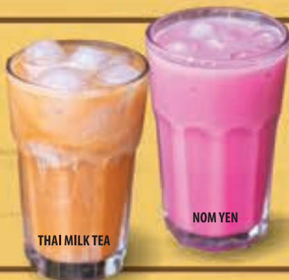
THAI MILK TEA